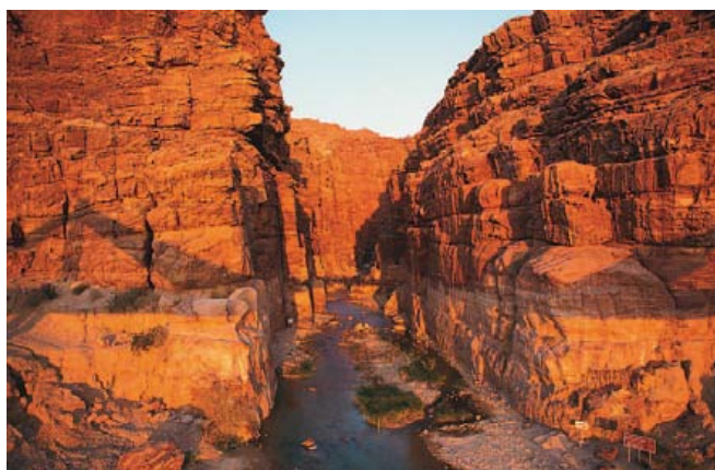
Jordan is rich in geological and geophysical features which will support the implementation of an integrated field exercise.

The Hashemite Kingdom of Jordan will host IFE14 and is providing an area of approximately 1000 km 2 on the banks of the Dead Sea – some 100 km south-west of Amman – where the exercise will be conducted. Jordan has a rich variety of geological features which will allow the testing of OSI aspects under realistic conditions.