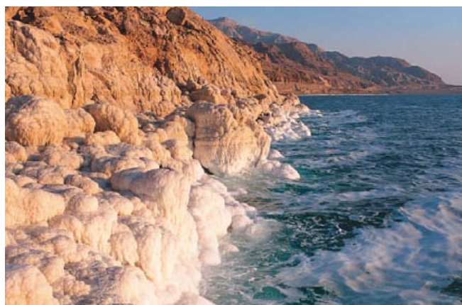
The host country will provide an inspection area of up to 1000 km 2 on the banks of the Dead Sea.

These features include landslides along the eastern shore of the Dead Sea, recently created sinkholes as a result of the Dead Sea water level lowering in Al-Hadeetha and successions of water terraces in the Al-Mujib Delta. The geology is therefore helpful in the development of a technically credible scenario for the exercise.