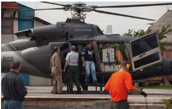
Visual observations and other measurements were made from the air during Build-Up Exercise III in Hungary in 2013.

The Treaty defines specific activities and techniques that can be applied during an OSI, starting with less intrusive and moving to more intrusive techniques.