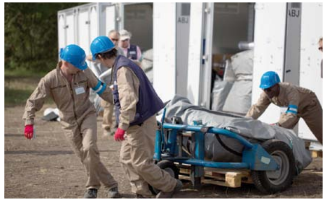
In preparation for IFE14, the organization conducted a series of build-up exercises to practise each phase of an OSI.

Deploying an inspection team into the field is extremely time critical, as there is only a narrow time window during which