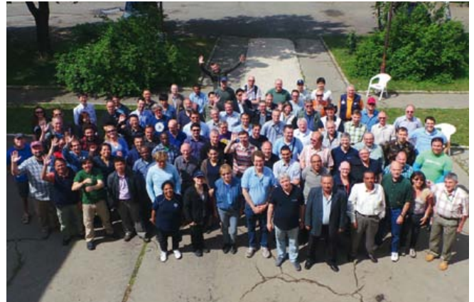
BUE III participants, a number of whom shall participate in IFE14.