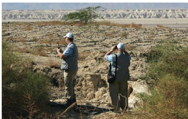
Ground based visual observation techniques and communications infrastructure were tested in Directed Exercise 2010 held in Jordan.

The Integrated Field Exercise 2014 (IFE14) – a simulation of an OSI – is being organized by the Preparatory Commission and shall take place in the Hashemite Kingdom of Jordan in late 2014. The exercise will be the largest and most technologically advanced simulated OSI ever conducted, allowing the testing of procedures, equipment and techniques in a comprehensive and integrated manner.