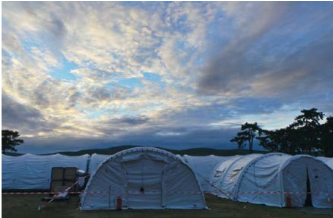
The base of operations during BUE III in Hungary in 2013.