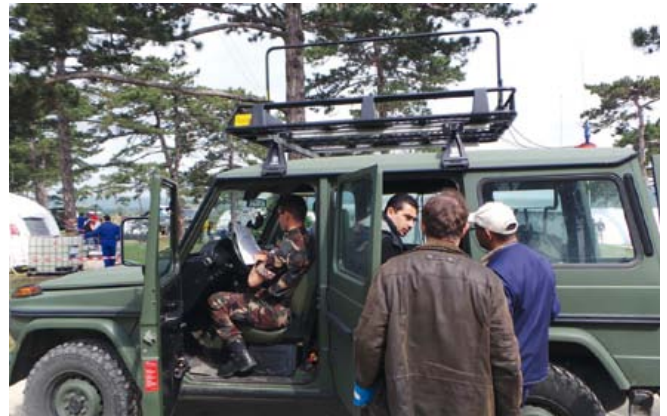
Inspectors use HF, UHF and VHF as well as satellite based communications to stay in contact with the base of operations and CTBTO headquarters in Vienna.