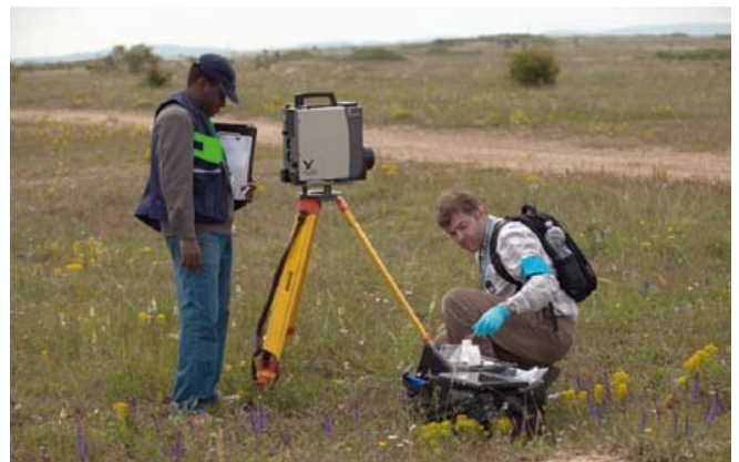
Surrogate Inspectors check a site for radionuclides during an OSI exercise.

The inspection team in IFE14 will utilize almost every technique permitted by the Treaty in order to determine whether a nuclear explosion has taken place.