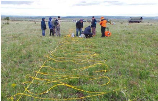
One of the geophysical inspection techniques used by the inspection team is the measuring of electrical conductivity in the ground.

IFE14 is divided into four phases, each of which will be played as close as possible to the time lines defined by the Treaty.