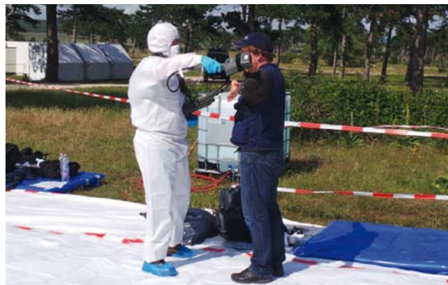
The decontamination of inspectors upon their return from missions in the inspection area during Build-Up Exercise III in 2013.

In order to provide a realistic environment for the effective execution of procedures, equipment performance, information management, inspection team functionality and report preparation by simulating a fully integrated exercise, technical experts nominated by States Signatories and Jordanian representatives are working closely to create a technically realistic, scientifically credible and intellectually motivating scenario for IFE14.